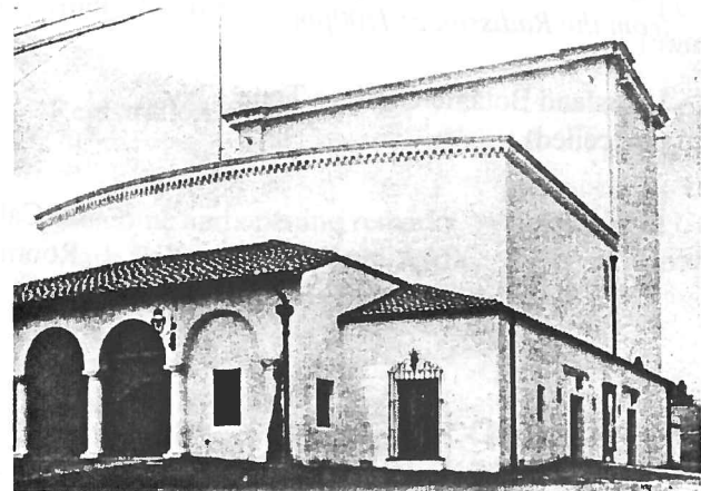
Santa Barbara's Lobero Theatre as it appeared in 1924.