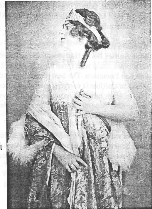
Lotte Lehmann in Tosca, 1923.

682-6787 Santa Bar- bara's largest independent bookstore.