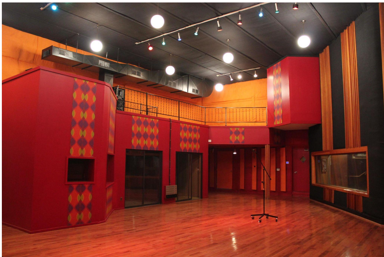
United Sound Systems Recording Studios