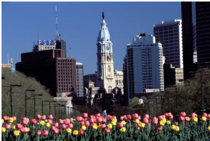
Philadelphia skyline in Spring.