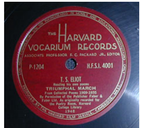
Harvard Vocarium Recording.