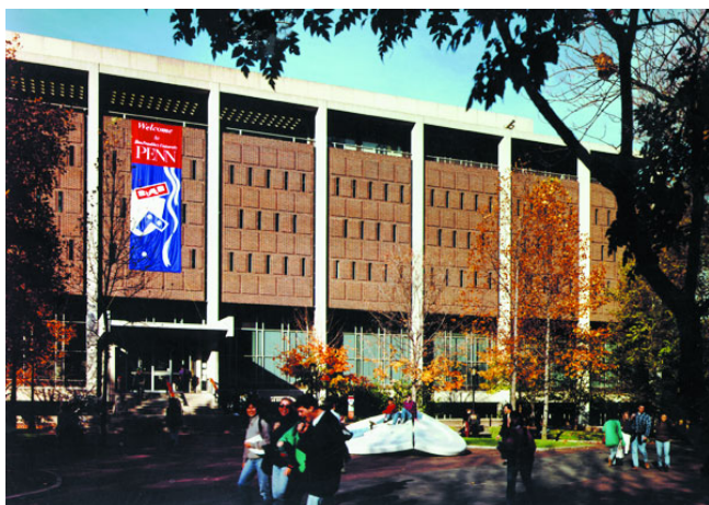
University of Pennsylvania Campus.

The 37 th annual ARSC conference will be held in Philadelphia, on the campus of the University of Pennsylvania, May 28-31, 2003. Founded by Benjamin Franklin in 1749, the University offered the nation's first modern liberal arts curriculum and now supports 4 undergraduate and 12 graduate and professional schools with a total enrollment of over 22,000 students. Conference sessions will be held in Houston Hall, located in the center of campus. The country's first student union, Houston Hall was built in 1894