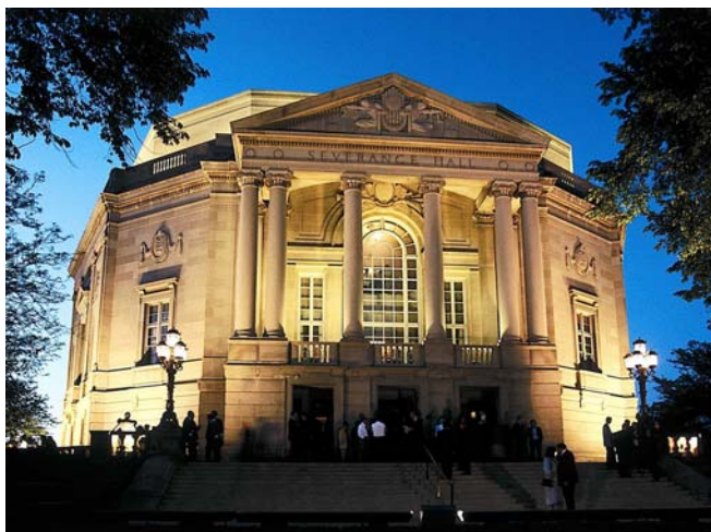
Located in University Circle, Severance Hall is home to the Cleveland Orchestra.

The Cleveland Orchestra. Founded in 1918, the Cleveland Orchestra is considered among the best in the United States. Speakers scheduled are: